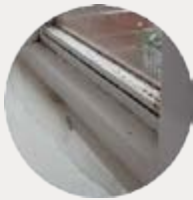
Water on windowsill

Important: Promptly remove all standing water to avoid microbial growth.