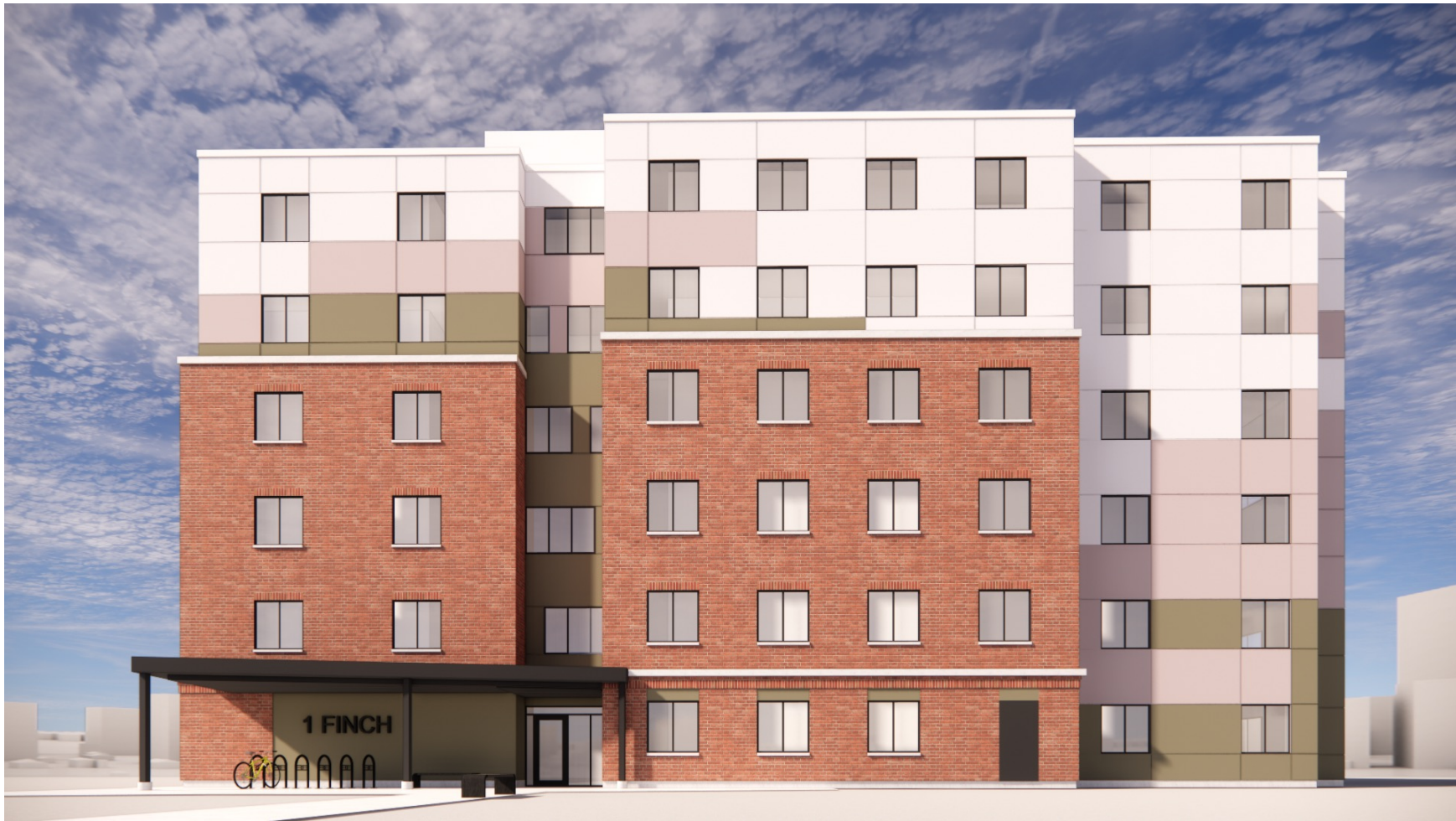
Front Elevation (South-West)