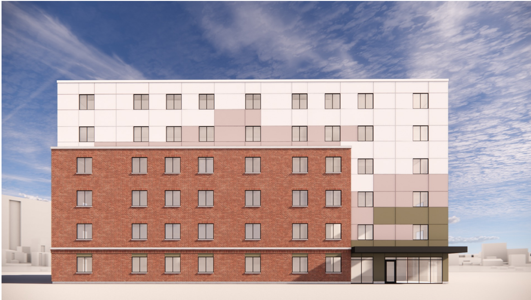
Rear Elevation (North-East)