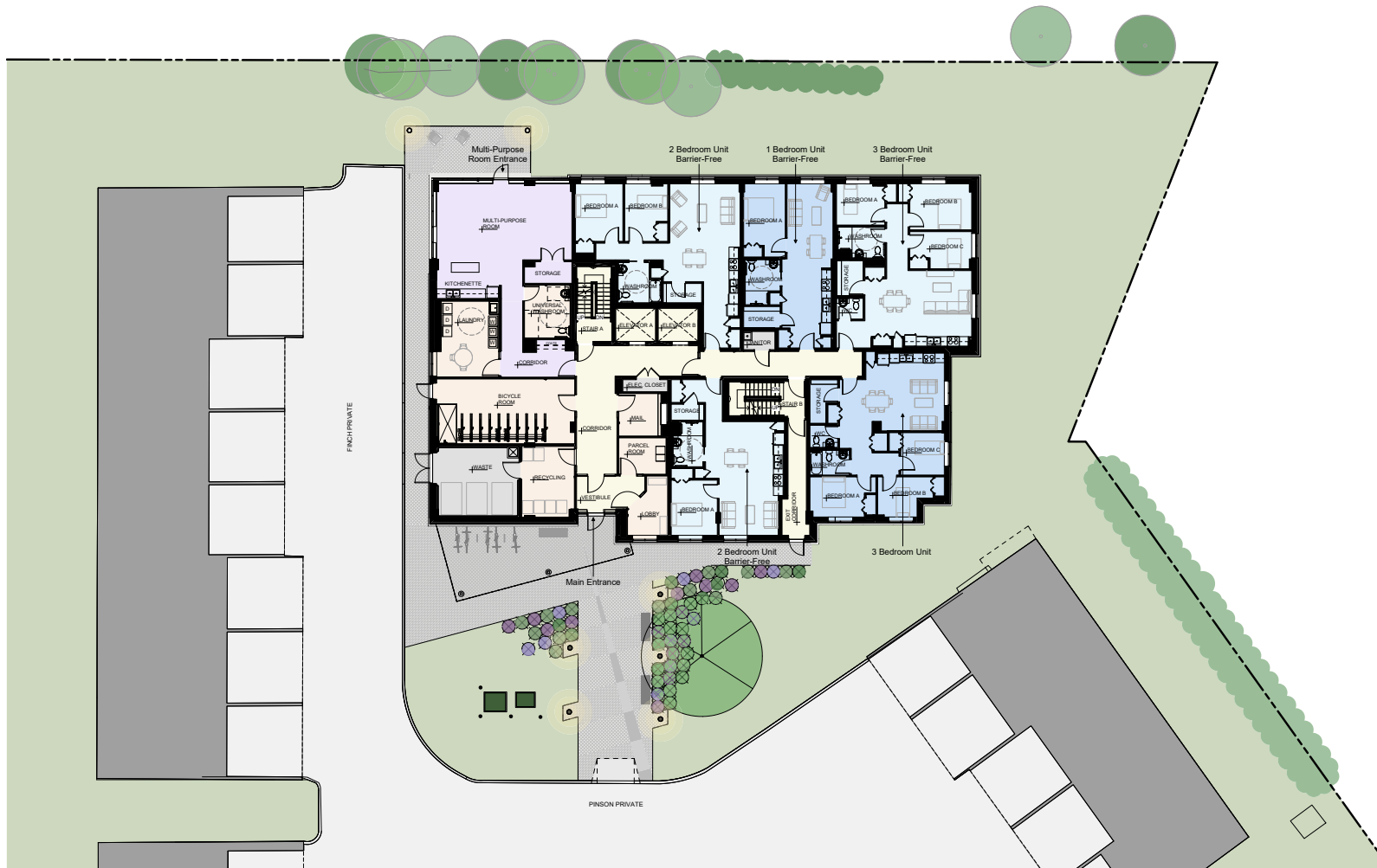
Site Plan/Ground Floor Plan